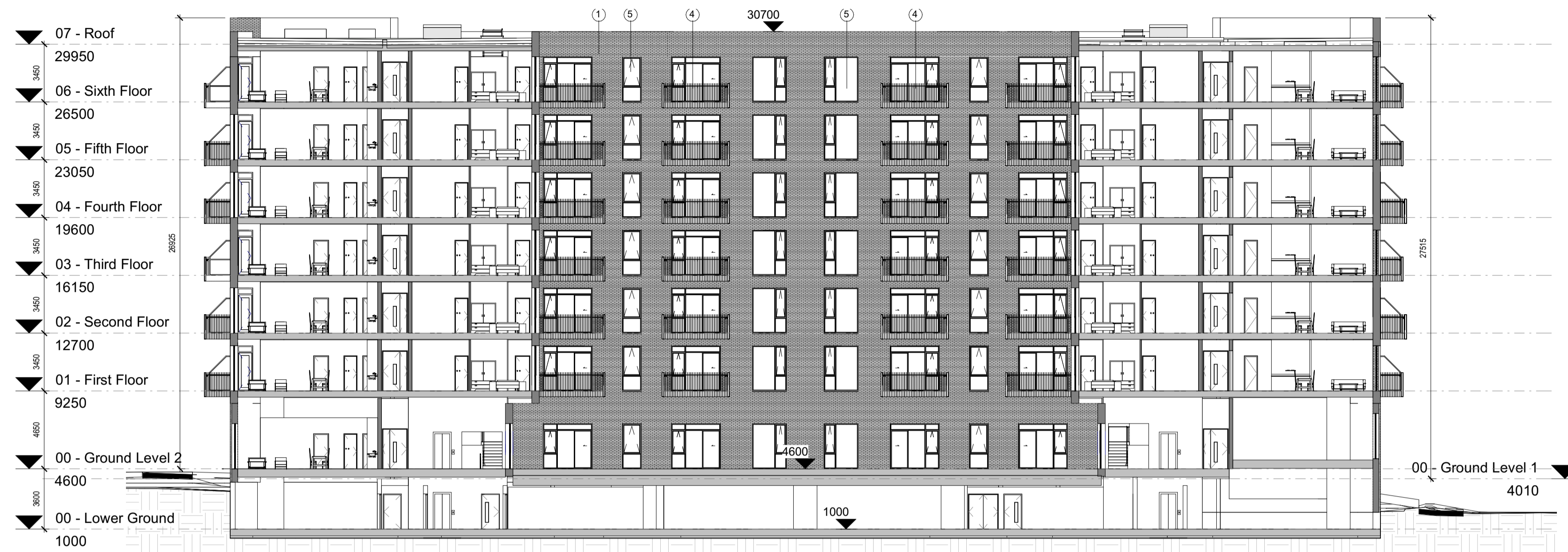
1 Block 1 - Section A-A 1 : 200

NOTE ALL DIMENSIONS TO BE CHECKED ON SITE NO DIMENSIONS TO BE SCALED FROM THIS DRAWING THIS DRAWING IS TO BE READ IN CONJUNCTION WITH RELEVANT CONSULTANTS DRAWINGS