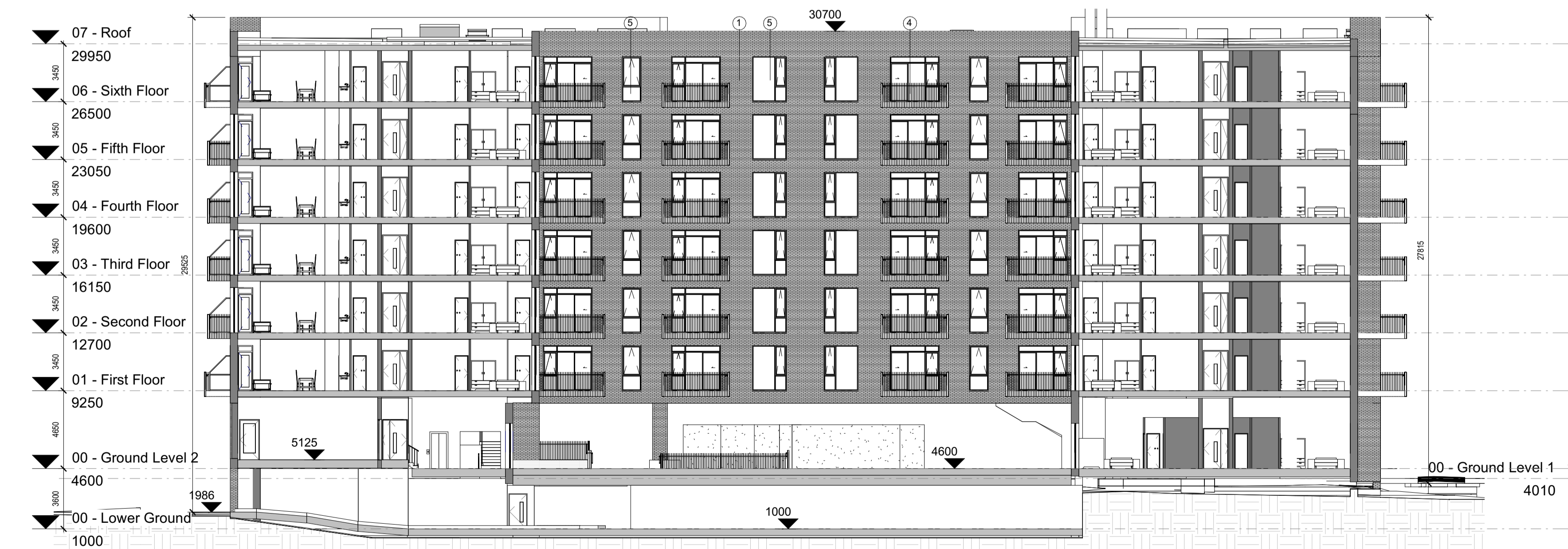
2 Block 1 - Section B-B 1 : 200

DRAWING ISSUED FOR PLANNING APPLICATION NUMBER: DSDZ4279/18 GRANTED: 18/12/2018